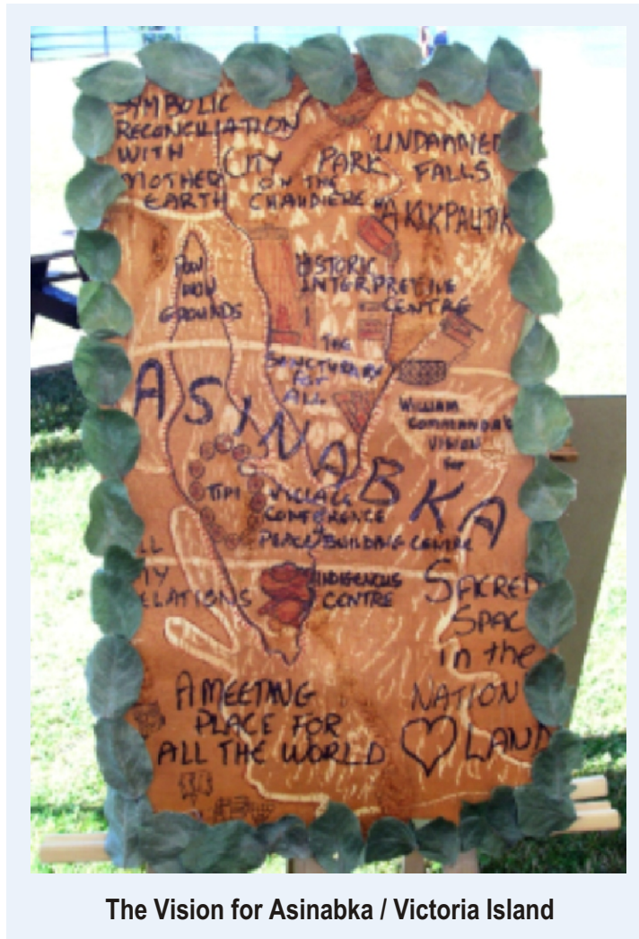
The Vision for Asinabka / Victoria Island

the diplomatic corps, environmentalists, peace activists, writers, musicians and artists, the Chief and Deputy Chief of Police from the City of Ottawa and representatives of the Royal Canadian Mounted Police, Ontario Provincial Police and Surete du Quebec: ordinary folk and extraordinary folk.